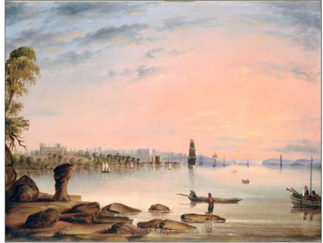
Source 4 – Sydney NSW from Garden Island, Government House on left, 1846, by GE Peacock

From the collections of the State Library of NSW http://www.acmssearch.sl.nsw.gov.au/search/itemDetailPaged.cgi?itemID=825839